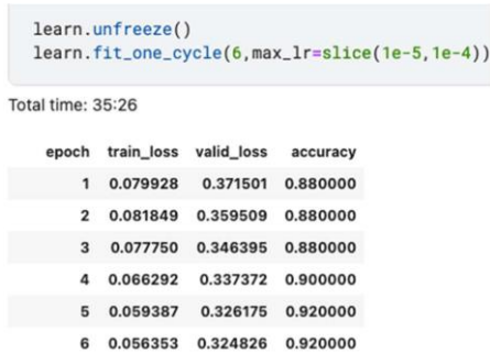
Fig. 3. Fine Tune Result of ResNet101

The model went through fine tuning process to train for 6 more epochs which improved performance accuracy to achieve 92% as revealed in figure 3.