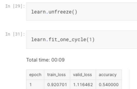
Fig. 1. ResNet34 Fine Tune Process Result

Then the ResNet34 model was unfrozen to go through fine tuning process with further training for one more epoch which resulted in slightly higher accuracy of 54% as illustrated in figure 1.